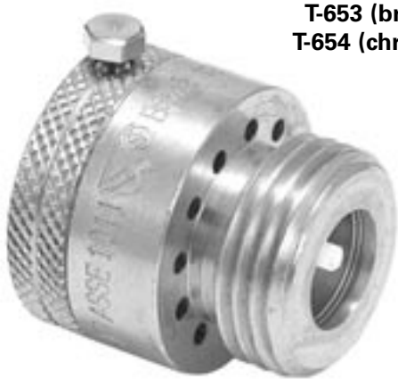
T-653 (brass) T-654 (chrome)

The Company, for a period of one year from the date of shipment, warrants each product or system of its own manufacture to the original purchaser to be free from defects in material and workmanship under normal use, service and maintenance.