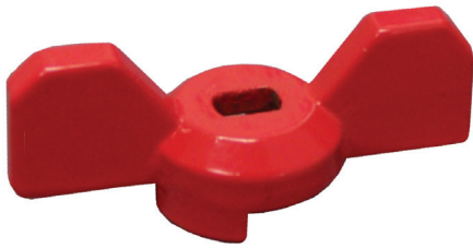
899-123 and 899-125