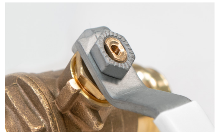
Blow-Out Proof Stem & Self-Locking Nut