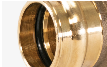
2 nd Generation PTFE Seats