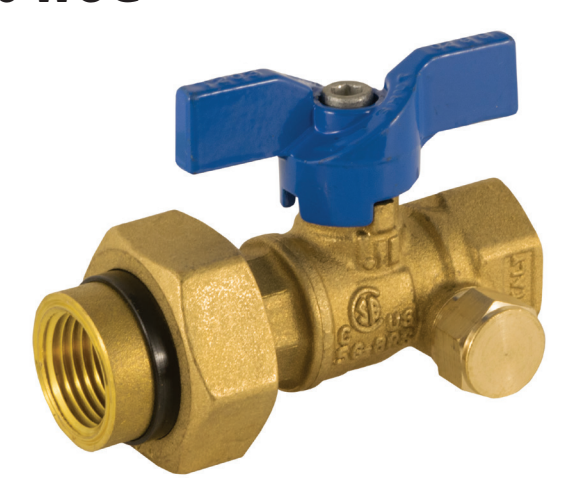
T-203DU - FIP DU x FIP